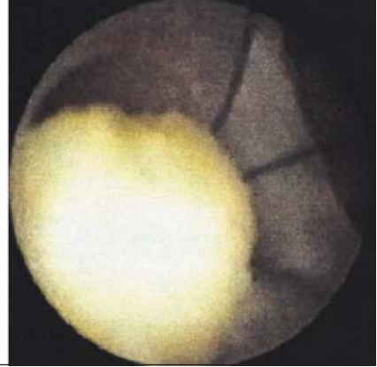
Figure 2. Sialendoscopic stone retrieval by a grasping basket.

pensive equipment. In addition, these techniques could result in significant damage to the gland.