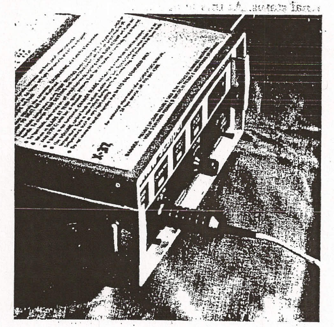
FIG. 1. The controller unit of the hemostatic scalpel.

The reusable handle is connected to the controller with light flexible cable; handle and cable can be gas or steam sterilized (Fig. 2). The disposable blades (Fig. 3) are similar to the conventional scalpel blades in shape and are available in size 10, 11 and 15. They are made of steel and are coated with a layer of copper and nonstick coating. Placed between these layers there is electrical microcircuitry which, when activated, heats the blade and senses the temperature of the blade. Hemostatis is induced by the direct transmission of heat from the side of the blade to the tissues. The scalpel may also be used as "cold knife.". The